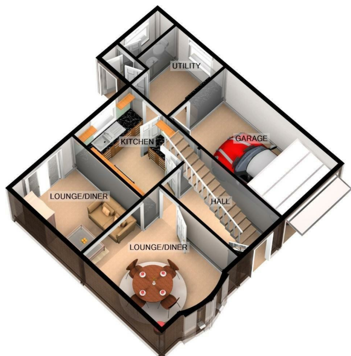
GROUND FLOOR APPROX. FLOOR AREA 654 SQ.FT. (60.8 SQ.M.)